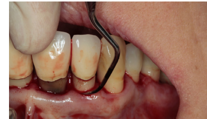
DS1CN on the buccal surface.

"We have found these instruments to be very ergonomic and easy to use. The design of the curette allows you to change the surface you are treating without changing instruments, thus reducing the number of instruments you have on your tray. The sharpness, hardness and flexibility of the tips are amazing. They feel like new instruments every time!"