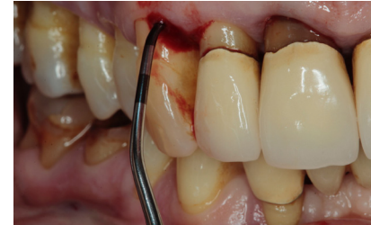
DS1CN on the anterior area.